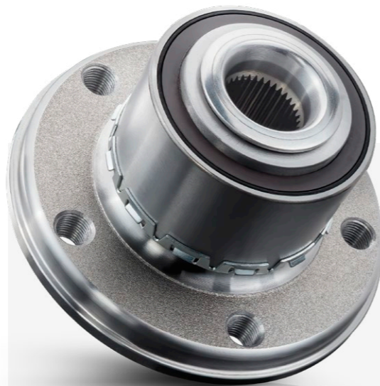
FLANGED HUB UNIT GENERATION 2

Sealed hub bearing unit with dual-row ball or tapered bearings. Factory lubricated, maintenance free and self adjusting. Designed for reliable everyday driving applications.