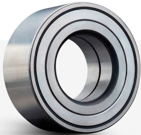
HUB UNIT BEARING GENERATION 1

Sealed hub bearing unit with dual-row ball or tapered bearings. Factory lubricated, maintenance free and self adjusting. Designed for reliable everyday driving applications.