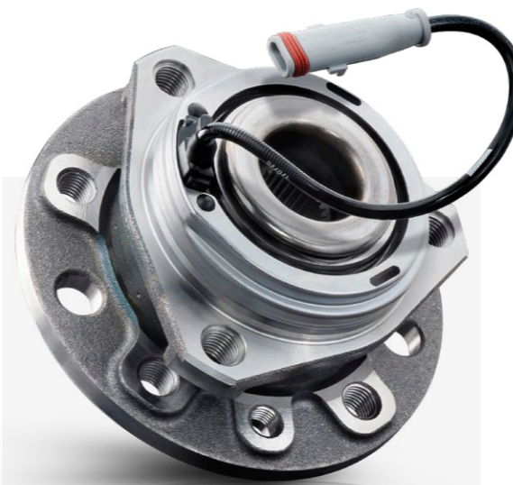
INTEGRATED HUB BEARING ASSEMBLY GENERATION 3

Flanged Hub unit with bolt on fitment for faster installation. Often includes magnetic encoder for ABS functionality. Improves installation efficiency and wheel speed accuracy.