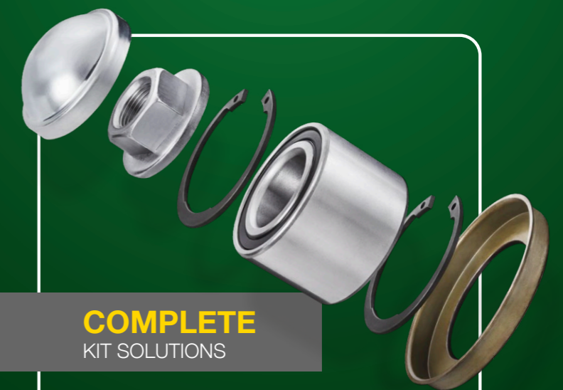
COMPLETE KIT SOLUTIONS

Everything included in one box, reducing fitting issues and saving installation time.