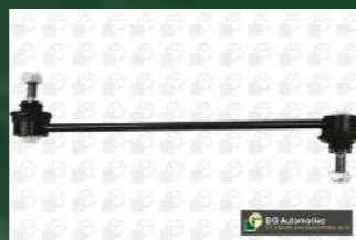
LS9606 Fits popular AUDI, SEAT, SKODA and VW models.