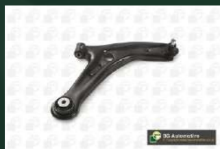
TRC2396 Fits popular FORD and MAZDA models.