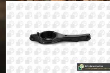
Track Control Arm