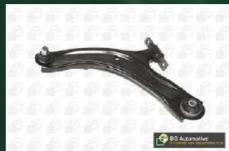
TRC6307 Fits popular NISSAN and RENAULT models.