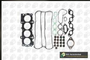
Cylinder Head Gasket Set