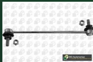
LS7302 Fits popular NISSAN and RENAULT models.