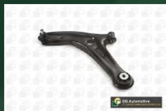
TRC2395 Fits popular FORD and MAZDA models.