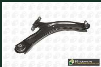
TRC6308 Fits popular NISSAN and RENAULT models.