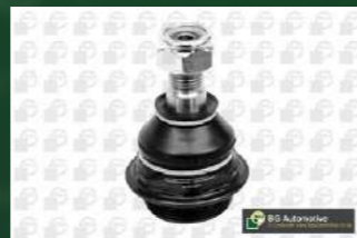
SJ6702 Fits popular CITROËN, DS, PEUGEOT and SUZUKI models.