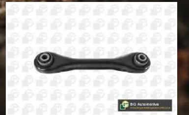
Track Control Arm