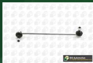
LS9607 Fits popular AUDI, CUPRA, SEAT, SKODA & VW models.