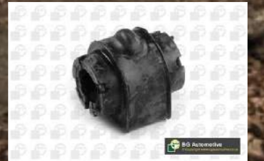
Stabiliser Bar Mounting