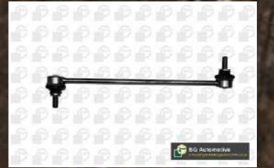
Stabiliser Rod / Strut