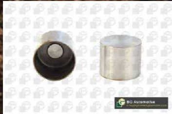
Rocker / Tappet