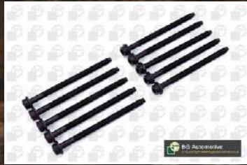
Cylinder Head Bolt Kit