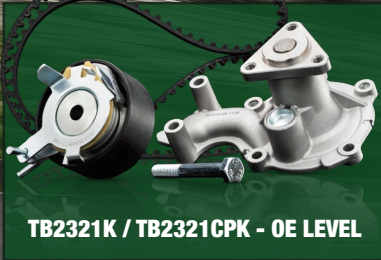
TB2321K / TB2321CPK - OE LEVEL