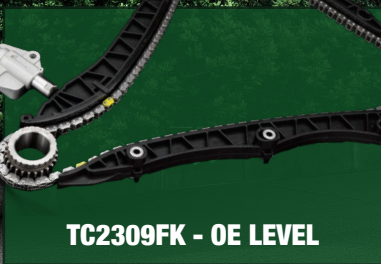
TC2309FK - OE LEVEL